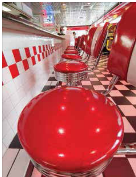
Diner seats await patrons at the Blast From the Past Diner in East Waterboro, Maine

Retro Roadtrip: Maine is available on Amazon and at www.retroadtripper.com .