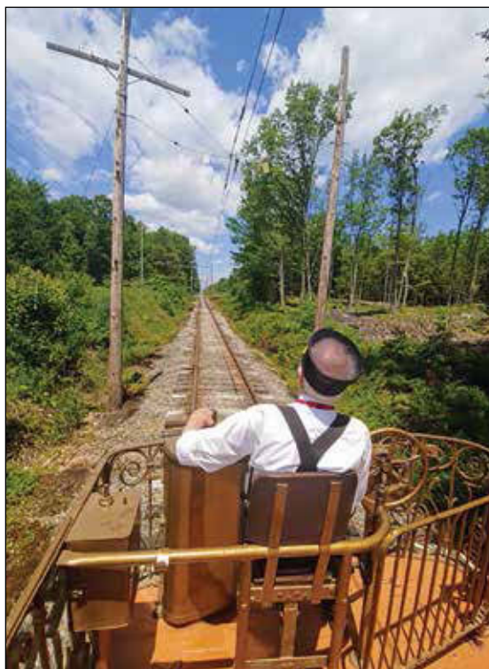
Above left: On Canada Day at the Seashore Trolley Museum, a conductor navigated the Golden Chariot, affectionately referred to as the Brass Bed. Above right: The front window of The Early Bird on Main Street in South Berwick (or SoBo, as the cool kids call it)